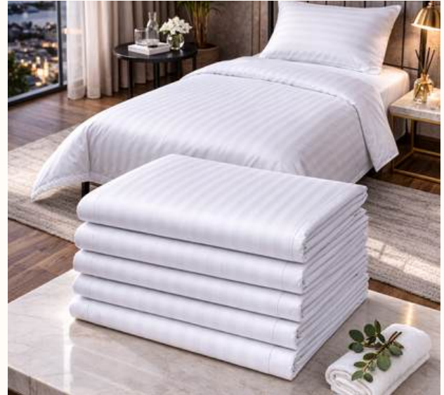
Single Hotel Duvet Cover – 210 Thread Count

The Royaltex 160x230 cm, 210 TC striped polysatin duvet cover offers a comfortable sleep experience with its elegant texture and modern look. Its breathable fabric ensures hygiene and a pleasant atmosphere in hotel rooms. With its durable and easy-to-iron structure, it is an ideal choice for frequent use.