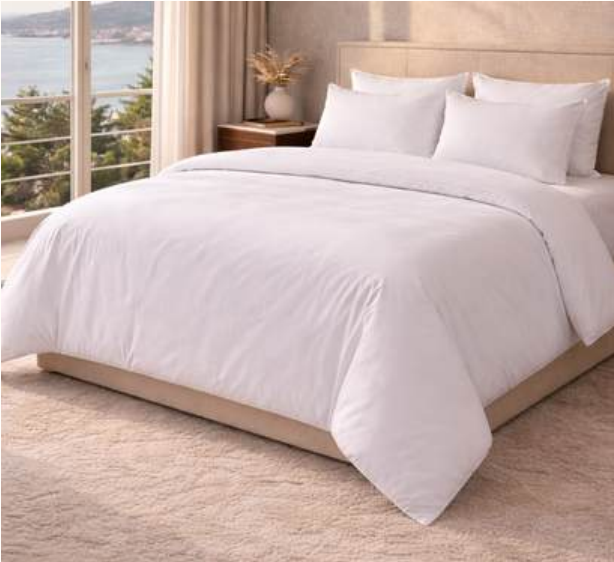
Double Hotel Duvet Cover - 210 Thread Count

Royaltex hotel duvet covers provide comfort and hygiene in hospitality settings with their soft texture and durable structure. Thanks to their breathable cotton fabric, they offer long-lasting and practical use in hotels, dormitories, and guesthouses. Their elegant appearance enhances the guest experience. We offer tailored solutions with various size and thread count options to meet your specific needs.