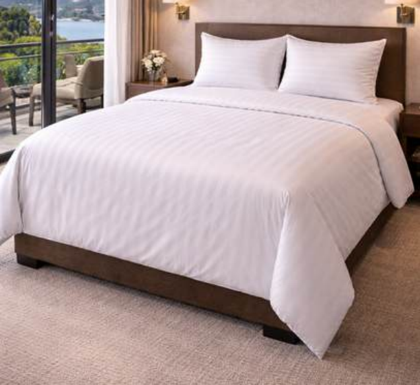
Double Hotel Duvet Cover - 210 Thread Count

Royaltex hotel duvet covers provide comfort and hygiene in hospitality settings with their soft texture and durable structure. Thanks to their breathable cotton fabric, they offer long-lasting and practical use in hotels, dormitories, and guesthouses. Their elegant appearance enhances the guest experience. We offer tailored solutions with various size and thread count options to meet your specific needs.