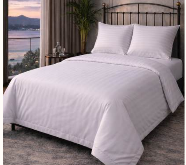
Double Hotel Duvet Cover - 210 Thread Count

The Royaltex 200x230 cm 210 thread count striped polysatin double duvet cover offers a comfortable sleep experience with its elegant texture and refined surface. Its breathable structure ensures a fresh and hygienic environment in hotels and similar accommodation settings. Easy to iron and durable, it is an aesthetic and practical choice ideal for frequent use.