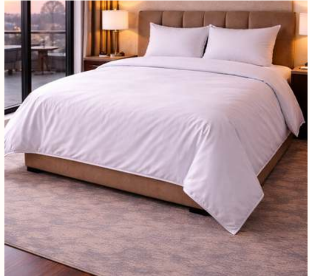
Double Hotel Duvet Cover - 300 Thread Count

The Royaltex 200x230 cm 210 thread count plain white cotton satin duvet cover offers a comfortable sleep experience with its soft texture and simple appearance. Its breathable structure ensures a fresh and hygienic environment in hotels and similar accommodation settings. Easy to iron and durable, it is an aesthetic and practical choice ideal for frequent use.