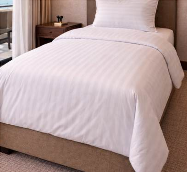
Single Hotel Duvet Cover – 210 Thread Count

Royaltex hotel duvet covers offer comfort and hygiene during stays with their soft texture and long-lasting structure. Made from breathable cotton fabric, they provide practical use in facilities such as hotels, dormitories, and guesthouses. Their elegant appearance and durability enhance the guest experience. With various size and thread count options available, we offer tailored solutions to meet your specific needs.